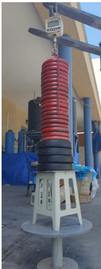
Image of experiment 1